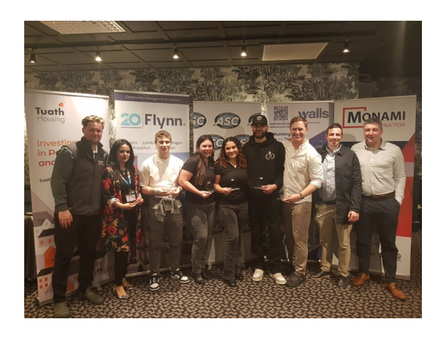
1st Place -LJMU/Chico