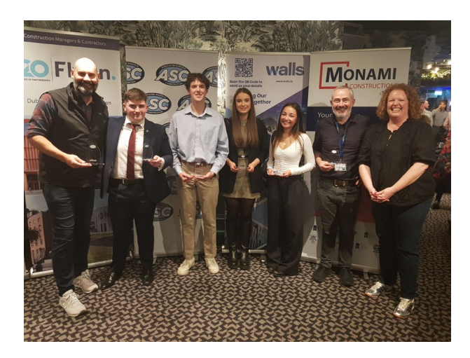
3rd Place -TuD/Boise