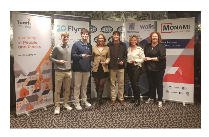
1st Place -OU