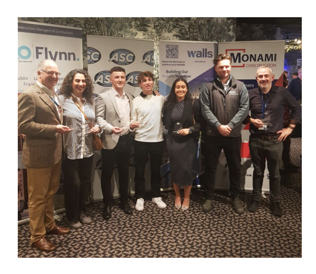
3rd Place -TuD/Denver