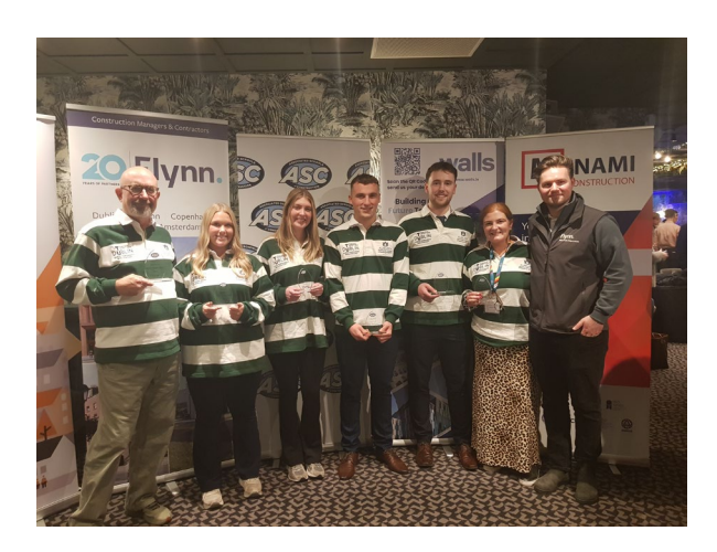
2nd Place -TuD/Auburn