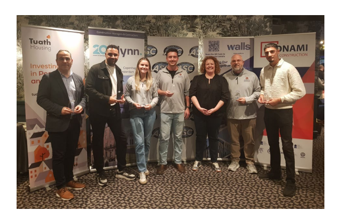
2nd Place -LJMU/Auburn