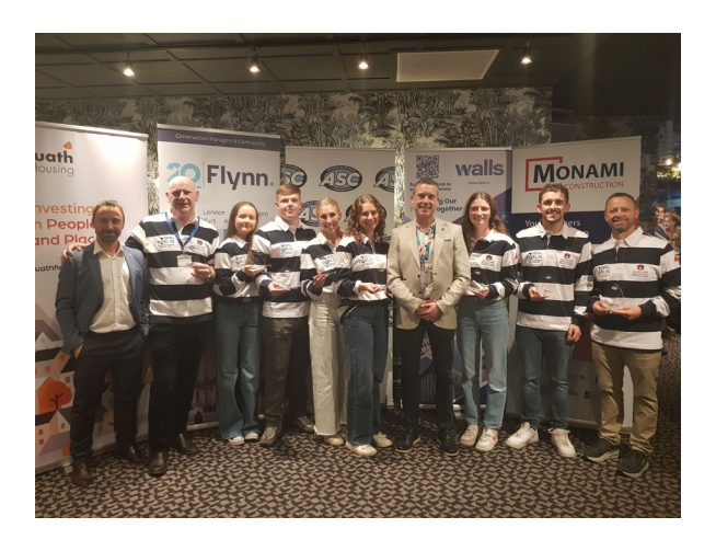
1<sup>st</sup> Place -Technological University Dublin / Auburn University