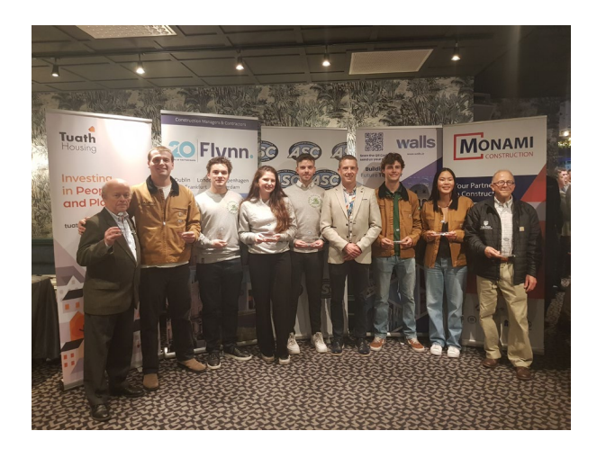
3rd Place -Czech Tech/Calpoly